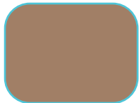
Light pinkish brown