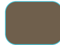
Dark greyish brown