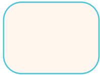
Light pinkish white