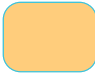
Mid sandy yellow