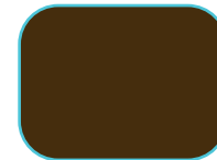
Very dark yellowish brown

When describing colours, it is useful to break it down into its constituent parts. Archaeologists often use a Munsell Colour Chart to help identify specific colours. This uses three elements (value, hue and colour) to describe a colour. A simpler method can be used to cover the soils you will see at most sites, and the colours and descriptions you see above give a good range of what you might find. When describing a soil colour, make sure you have a clean sample on the end of your trowel. Next, try and break the colour you see down into three main elements: